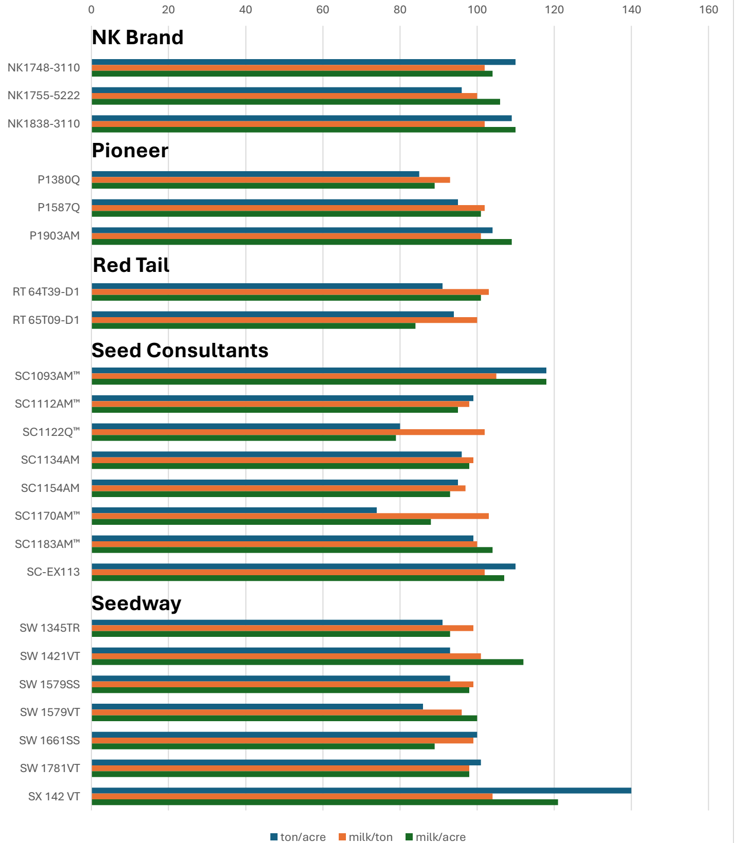
Figure 1.2. Chart displaying the multi-year, multi-site relative averages of tons per acre yield, pounds of milk per ton, and pounds of milk per acre. Chart does not consider the number of observations; see tables below for more details.