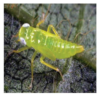
'Hooper burn' injury on peanut; adult and nymph are colored in bright green to yellow.