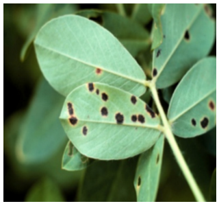
Early (Brown) and Late (black) Leaf Spot