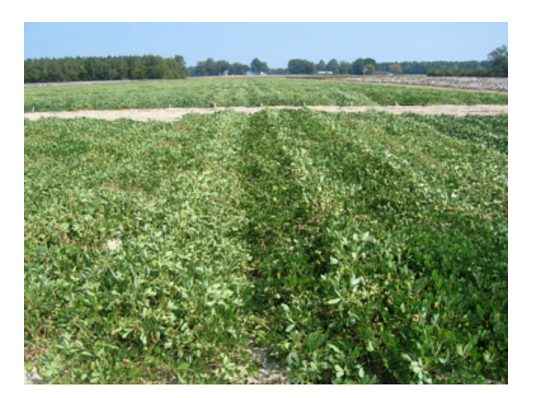
Drought sensitive (left) and tolerant (right) varieties