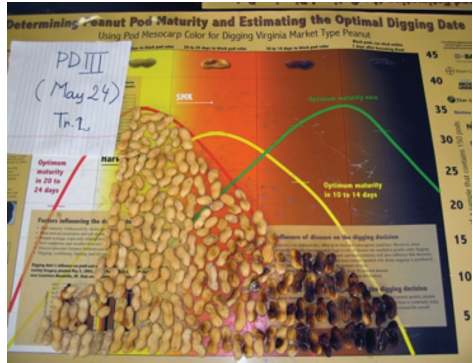
Variety ready to harvest (left) and 3 weeks from optimum harvest (right)