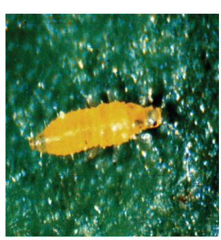
Thrips damage on peanut; adult and larvae feeding on leaves.