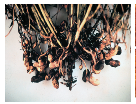
Root and pod rot caused by CBR