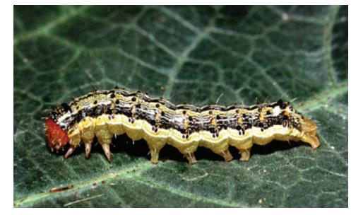
Larvae of corn earworm feeding on leaves