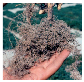
Root knot nematode galls