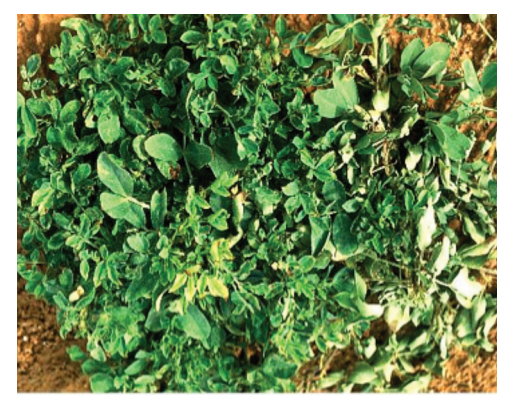
Tomato Spotted Wilt Virus showing stunned plants