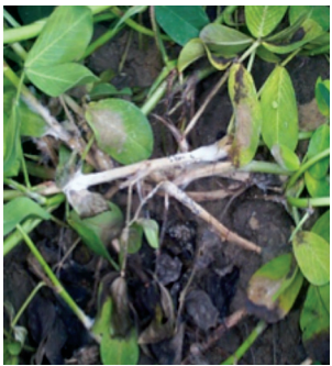
Sclerotinia blight (bleached)