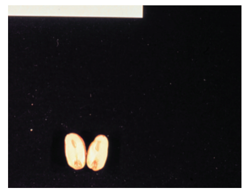
Germination failure due to Ca (left) and B (right) deficiency