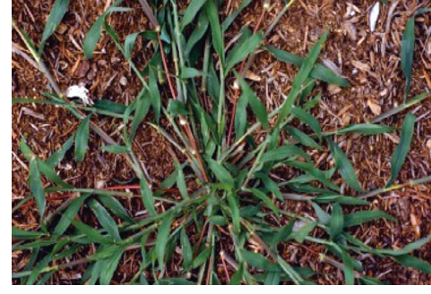
Valvet leaf Crabgrass