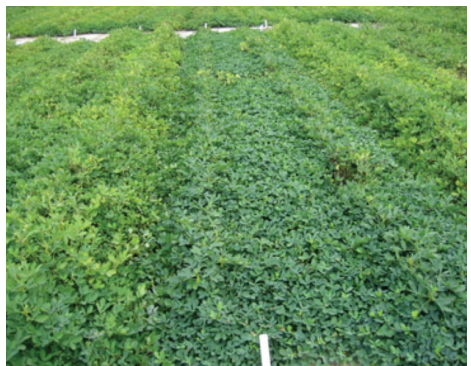
Disease susceptible (left) and resistant (right) varieties