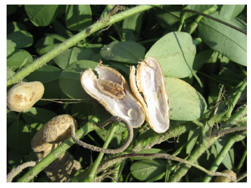
Calcium deficiency showing unfilled pods or "pops".