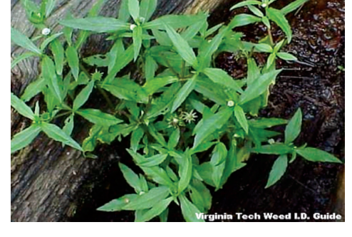
Prickly sida Eclipta