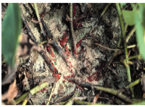
Red fruiting bodies of CBR