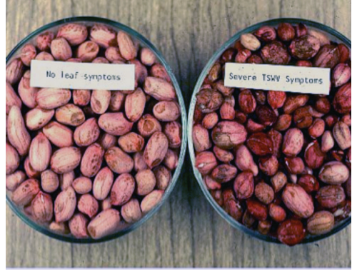
Seed of Tomato Spotted Wilt Virus infected plants