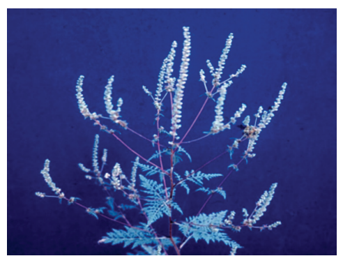
Ragweed, young and mature plants