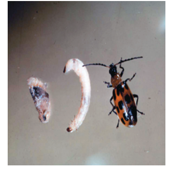
Pod damage by corn rootworm larvae; adults are also presented.