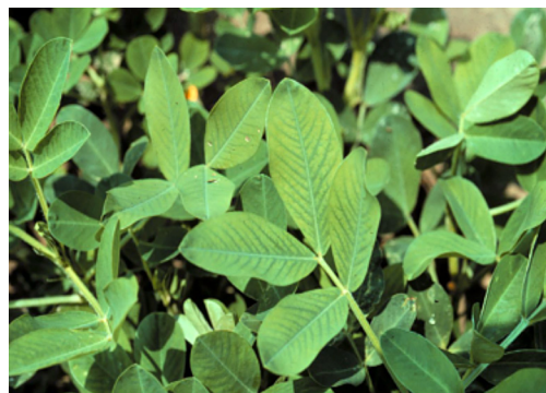
Manganese deficiency in peanut