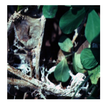
Southern stem rot (white mold)