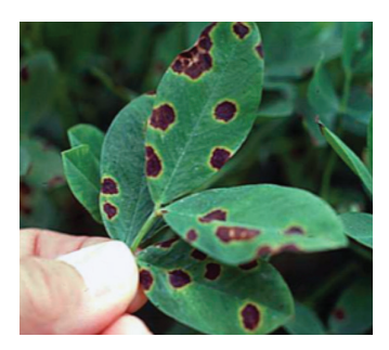
Early Leaf Spot