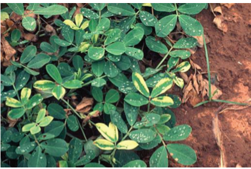
Chemical burn on leaf margins