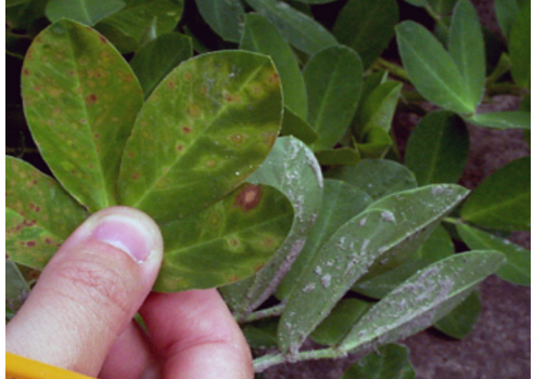
Tomato Spotted Wilt Virus on the peanut leaves