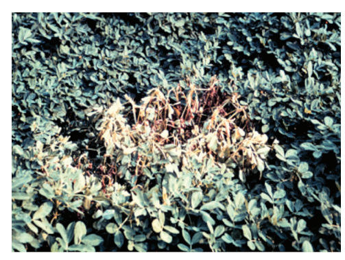
Cylindrocladium black rot (CBR)