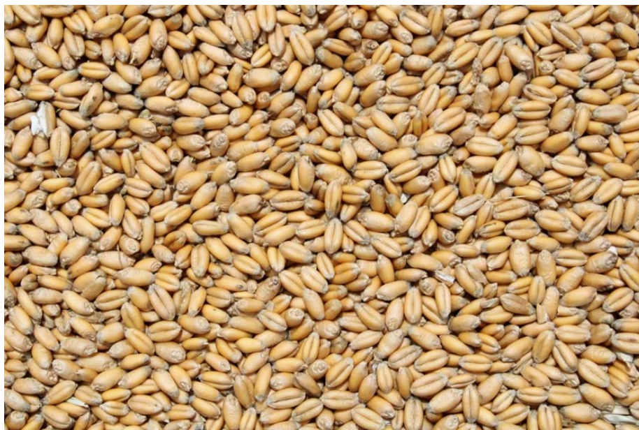
Figure 1: Soft red winter wheat grain following harvest.