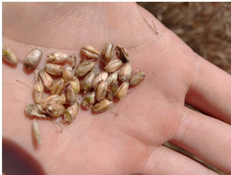
Figure 3: Sprout damage was observed by many producers during the 2023 wheat harvest as a result of frequent rainfall and cloudy weather on mature grain, delaying harvest and decreasing grain quality.