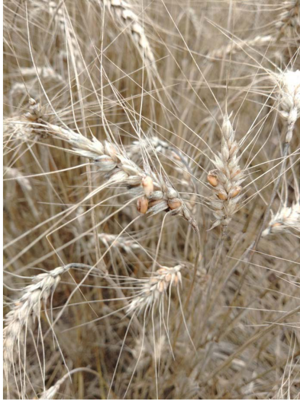
Figure 2: Shattering of wheat grain can be observed in this photo as a result of weather challenges at harvest. Seeds have begun to sprout and fall from the glumes on the head, resulting in decreased yields and harvest efficiency.